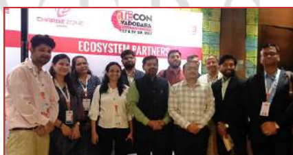
KIIF as Ecosystem Partner at TiEcon

Team KIIF actively participated at TiEcon Vadodara, engaging with startups, investors, and industry leaders to foster innovation, build networks, and create meaningful collaborations for driving impactful growth in the entrepreneurial ecosystem.