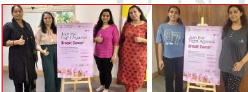
Glimpses of the D3S Healthcare Pilots at KU

In just three days, 95+ women received preventive breast health screenings through the BR Scan Light Clinic – a radiation-free, non-invasive device with 94% accuracy. With KIIF driving social impact and KCEIL creating an immersive experience, the initiative broke taboos, sparked vital conversations, empowered women for early detection, inspired students and academicians, and showcased how startups can deliver innovation for healthier futures.