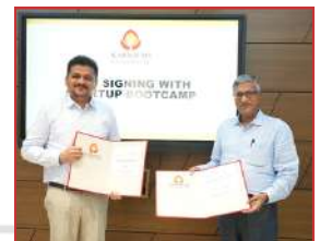
MOU Signing between KIIF & Startup Bootcamp

KIIF signs MoU with Startup Bootcamp India, a joint venture of Startup Bootcamp Australia and BRK Ventures, to foster innovation, support entrepreneurs, and create global pathways for startups to scale and succeed.