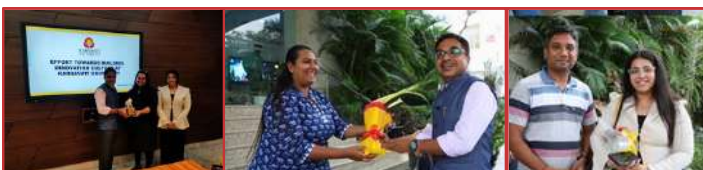
MeitY Startup Hub (MSH) Visited KIIF, Karnavati University