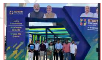
Team KIIF at Startup Conclave

Team KIIF participated in Startup Conclave 2025 at Mahatma Mandir, engaging with startups, investors, and ecosystem enablers to showcase innovations, build partnerships, and accelerate Gujarat's journey toward becoming a leading hub of entrepreneurship and innovation.