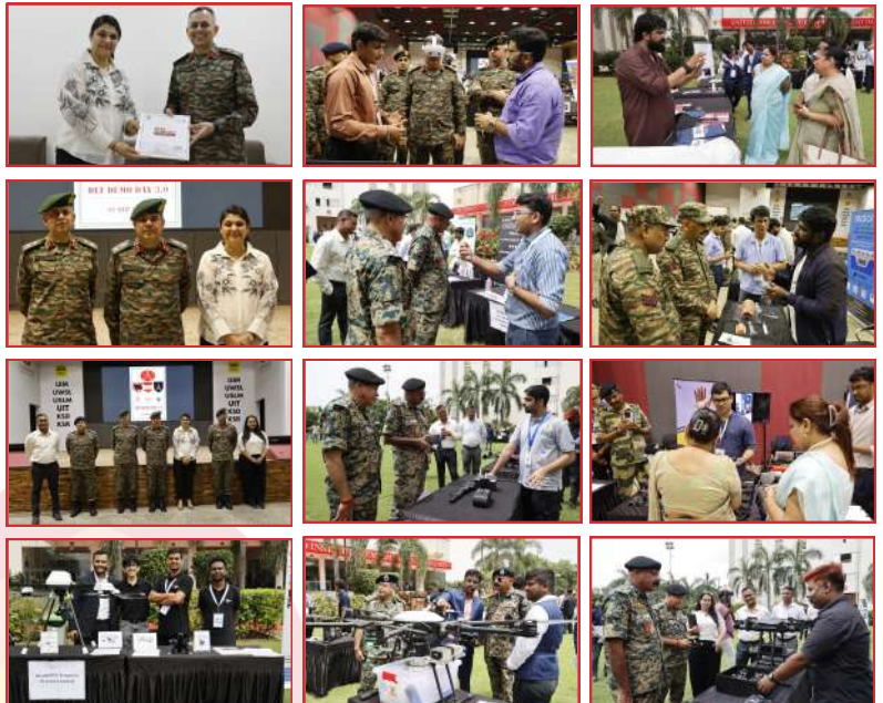
Glimpses of Defence Demo Day 3.0 at Karnavati University

Startups were given direct access to interact with defence officials, understand real-time operational requirements, and pitch for deployment opportunities. Notably, 24 startups were shortlisted for field trials, marking a milestone in fostering innovation for India's defence ecosystem.