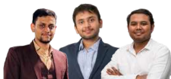
Founders of Arnobot

Arnobot began as a student startup determined to tackle one of industry's toughest challenges: inspecting and maintaining dangerous, hard-to-reach structures. What started with a magnetic wall-climbing robot quickly evolved into a suite of modular machines designed for real-world hazards — from boilers and ship hulls to rugged outdoor terrains. Their journey took a pivotal turn at Defence Demo Day 3.0, where Arnobot showcased its ground robot built for sandy landscapes. The prototype's strong performance earned them an invitation for Indian Army field trials, a defining milestone. With enhancements in durability and endurance now underway, Arnobot moves confidently toward defence-ready deployment and broader national impact.