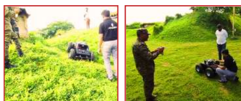
Highlights from Initial Trials Leading Into the Next Phase of On-Ground Testing