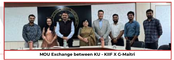
MOU Exchange between KU - KIIF X G-Maitri

KIIF signed an MoU with G-MAITRI (Gujarat – Mentorship and Acceleration of Individuals for Transforming Rural Income) to support rural innovators through mentorship, incubation, and capacity-building. The collaboration aims to strengthen grassroots innovation and accelerate income-generation opportunities across Gujarat.