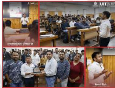
Glimpses of the Session