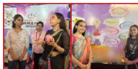
Glimpses of PINGZ at Purple Fest, Goa