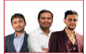
Founders of Arnobot