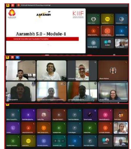
Glimpses of the Aarambh Sessions at Karnavati University

The sessions saw active participation from 50+ student innovators, reflecting strong enthusiasm for structured innovation and entrepreneurship. Together, these engagements laid a strong foundation for students to progress through the Aarambh 5.0 pre-incubation program and build impactful, viable innovations.