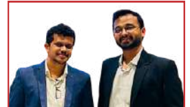
Founders of DeployNXT