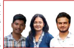
Founders of Drone Matrx

Under the MeitY GENESIS – Entrepreneur-in-Residence (EIR) Program, Karnavati Innovation & Incubation Foundation (KIIF) supported four deep-tech startups selected through multiple screening rounds involving startups and student innovators from Tier II and Tier III regions. The cohort reflects strong indigenous innovation aligned with national priorities. Notably, Drone Matrx, led by Karnavati University students, and other supported startups represent innovation in SpaceTech, Robotics, and Unmanned Systems, closely aligned with the university's defence-focused initiatives. The support under the scheme of MeitY Startup Hub (MSH) marks a key milestone for student-led innovation. Through the EIR program, KIIF enables founders with grant support, structured mentorship, capacity building, and validation assistance to progress from idea to impact.