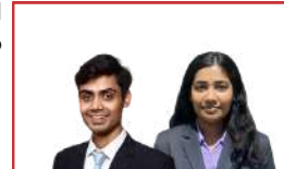
Founders of PrepSOM