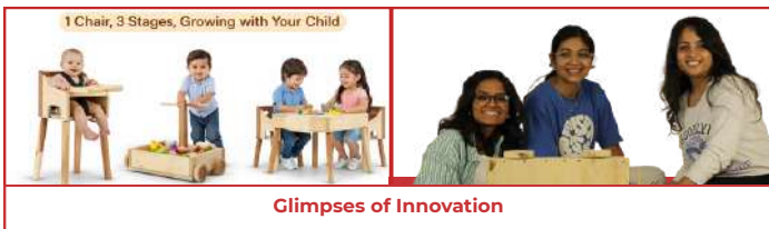
Glimpses of Innovation

Built primarily from sturdy, recyclable wood, Toodles offers greater stability and safety than typical plastic alternatives while reinforcing a strong sustainability focus. Guided by mentors Shueb Khan and Abhishek Karmakar, the project evolved from an academic concept into a real-world ready solution. With ₹75,000 support under SSIP through KIIF, the team was able to further develop and refine the product, taking a meaningful step toward market application and impact.